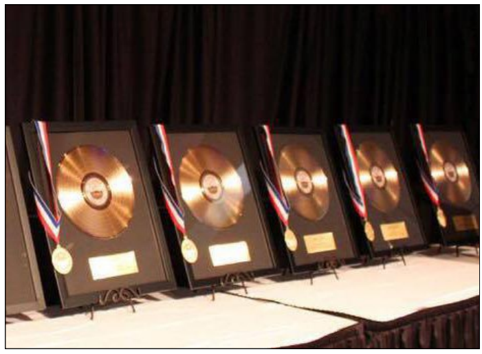
Above: Who will win the next medallions and gold records? It could be a radio personality you nominate.

the new 2016-17 membership year. Only members in good standing can nominate others. Membership can be renewed online at: <a href="http://tennesseeradiohalloffame.wildapricot.org/Join">http://tennesseeradiohalloffame.wildapricot.org/Join</a>