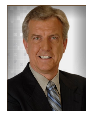
by Chip Chapman