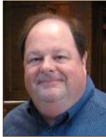
by Skip Woolwine Former TRHOF Board Member

You've probably heard the term "shortwave radio" before, but unless you're a radio geek, you might be clueless what it means, or what it's used for. Standard AM radio stations are found on frequencies from 530 kHz (kilohertz or kilocycles) up to 1700 kHz (aka "medium-wave").